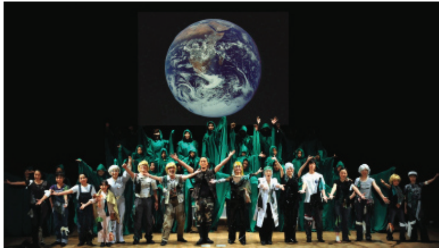
Japan Live Classic